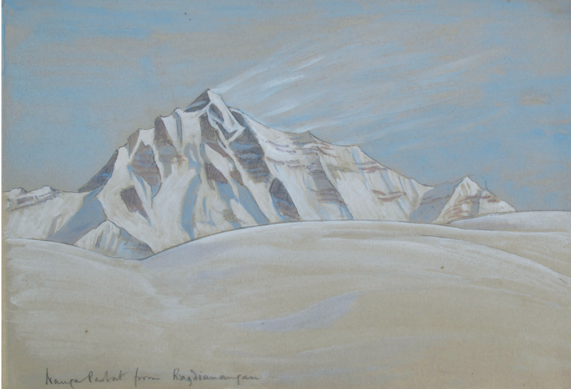
The 'rapid sketch' of Nanga Parbat that Somervell made from bear the Tragbal pass on 19 May 1933.

By early 1933, Howard Somervell (1890-1975) was almost desperate to see the Rupal face of Nanga Parbat 1 . He had seen the Kangshung face of Everest and the north-east face of Chomo Lonzo in 1922 and the north face of Nanda Devi in 1926. He was to write, 'I longed to see the immense southern precipice [of Nanga Parbat]', to 'enjoy Nanga Parbat, not to climb it – to paint it, not to struggle with it.'