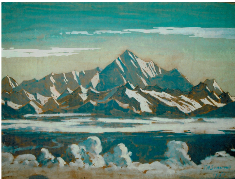
Nanga Parbat from Gulmarg, 1951.