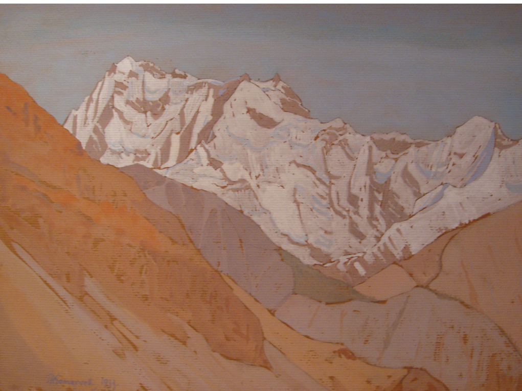
Nanga Parbat from Das Khirim painted on 24 or 25 May. All pictures are watercolour unless described otherwise.