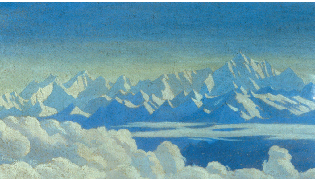
An oil painting of Nanga Parbat from 1952. (Alpine Club)