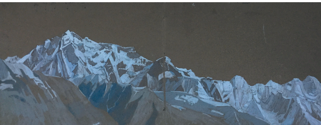
Nanga Parbat, Rakhiot and Chongra peaks from the Kamri valley, 26 May.